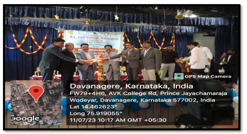
Inauguration by the Dignitaries