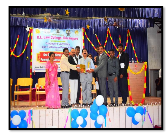
Felicitation to the resource person