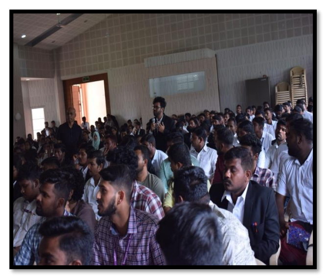
Participant asking question to the resource person