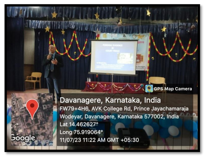
Resource person delivering lecture on the topic